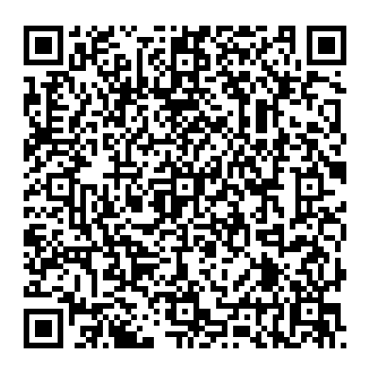
Scan to order! ¡Echa un vistazo para encargar!

Monday, December 11, 2023 Hall Memorial Middle School Retake Day!